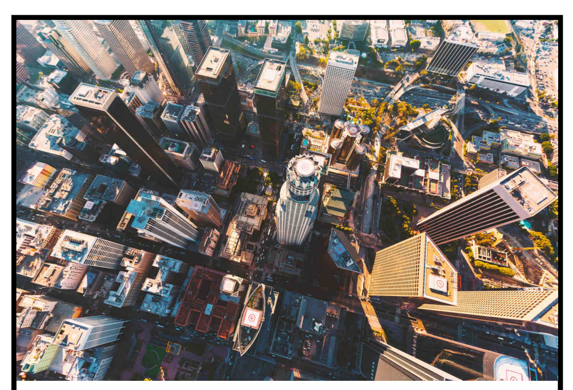
Urban Adventure Meeting October 30, 2022 - Reveal of 2023 destination!

( \underline{\textit{Important Note}} : The date of the trip has been extended \underline{\textit{one}} additional day.)