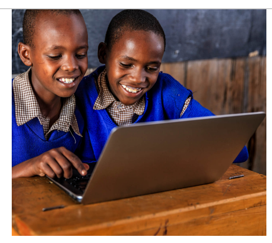
Social Justice at Nativity

Nativity's Social Justice Committee shares announcements, events and recommended resources to the Nativity community as we continue our pursuit of racial justice and reconciliation. Read more here .