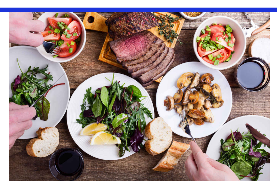
Grub Group Returns Next Week!

The Middle and High School youth are invited to hang out at Grub Group on November 2, 2022. We will gather at the Chick-Fil-A located at 8661 Six Forks Road from 6:30 pm - 7:30 pm. Together we will enjoy some time to catch up and meet new friends, then dive into a short Bible study. Just bring yourself, maybe a friend, and money for dinner. Please note that the location has changed.