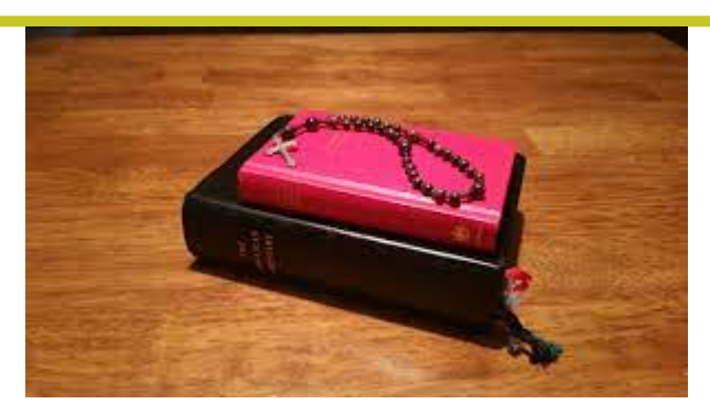
All Saints' Sunday