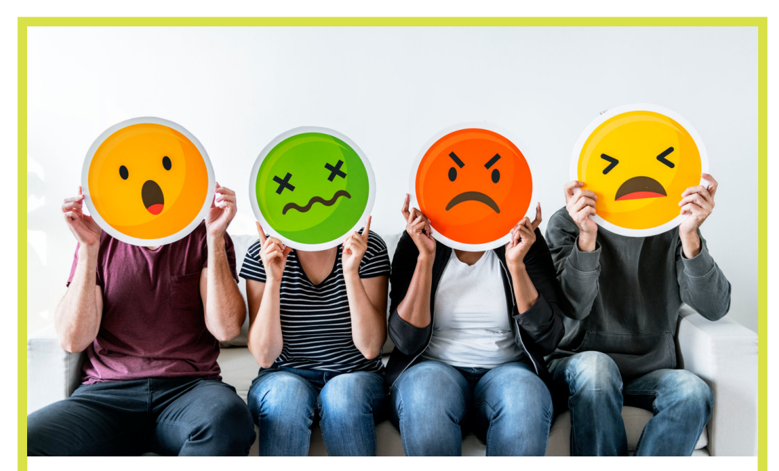
How to Talk with Kids about Racism and Diversity

The Middle and High School youth are invited to hang out at Grub Group on November 2, 2022. We will gather at the Chick-Fil-A located at 8661 Six Forks Road from 6:30 pm - 7:30 pm. Together we will enjoy some time to catch up and meet new friends, then dive into a short Bible study. Just bring yourself, maybe a friend, and money for dinner. Please note that the location has changed.