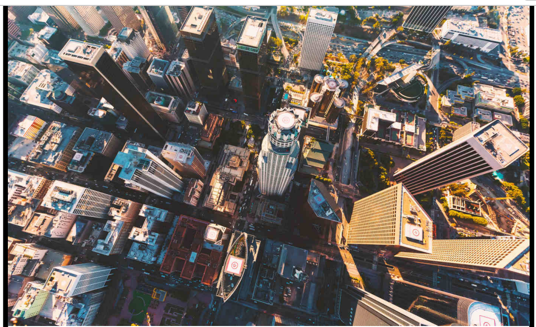
Urban Adventure Meeting October 30, 2022 - Reveal of 2023 destination!

(<u>Important Note</u>: The date of the trip has been extended <u>one</u> additional day.)