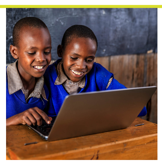
Social Justice at Nativity

Nativity's Social Justice Committee shares announcements, events and recommended resources to the Nativity community as we continue our pursuit of racial justice and reconciliation. Read more here .