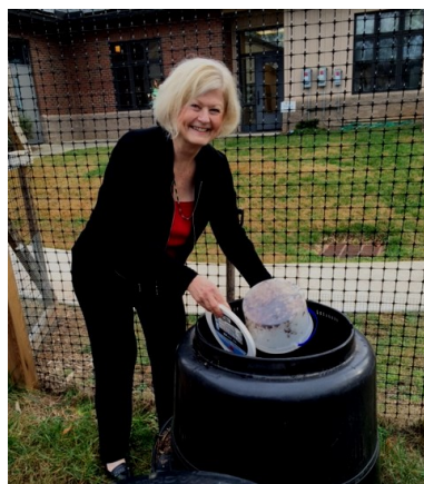
Nativity member adding kitchen scraps from home to a compost bin at church

Meat, fish, bones, dairy products, oils and fats, sauces, ashes, pet waste, diseased plants, weeds (especially with seeds), grass clippings.