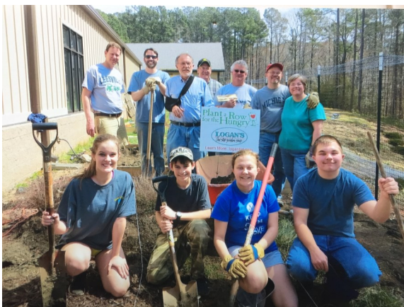
Nativity Community Garden was expanded in 2014

Many ways are being developed to sequester carbon. We all can help to slow climate change by making compost, which when applied to the land will increase plant growth leading to more carbon being removed from the air and stored in the soil in a process referred to as “carbon farming”.